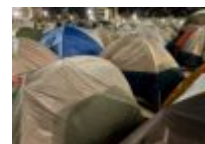
When her East Side