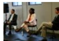
Providence mayoral candidates make their case to voters at southside forum