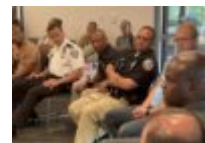
Exclusive: Providence Police meet with community leaders in lively public conversation